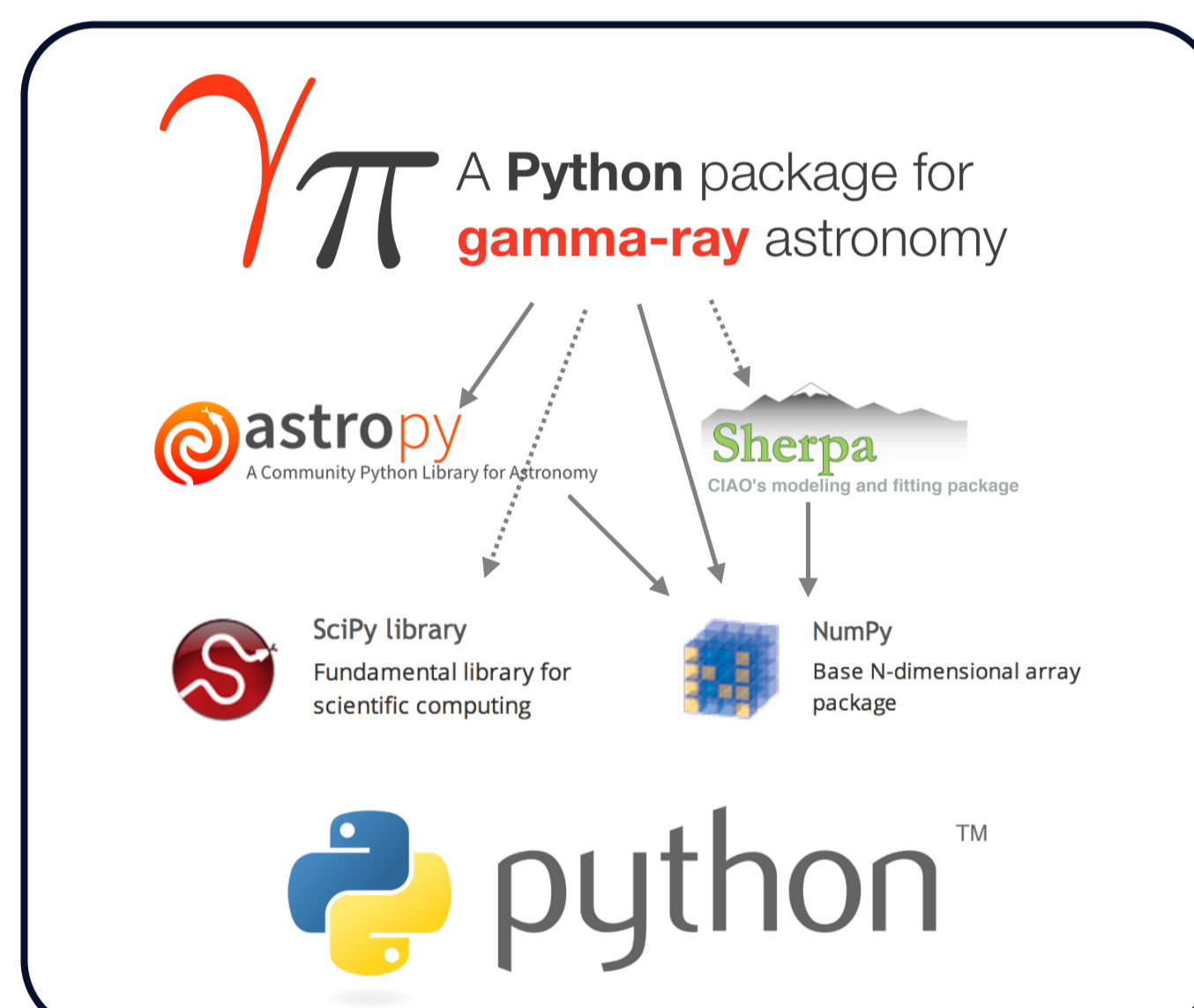
Fig. 1: Gammapy is a Python package, built on Numpy and Astropy as core dependencies.

The Cherenkov Telescope Array (CTA) will observe the sky in very-high-energy gamma-ray light soon. All astronomers will have access to CTA high-level data, as well as CTA science tools (ST) software. The ST can be used for example to generate sky images and to measure source properties such as morphology, spectra and light curves, using event lists as well as instrument response function (IRF) and auxiliary information as input.